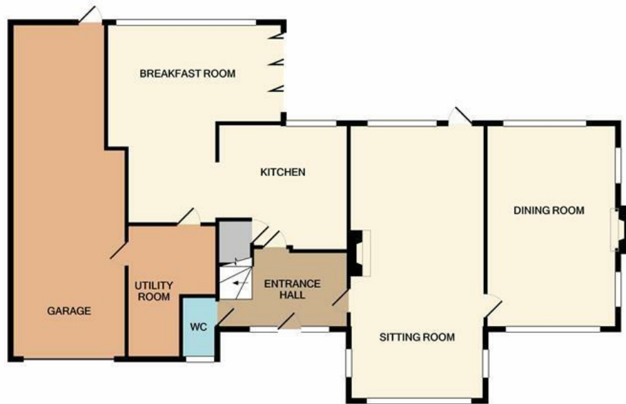
GROUND FLOOR APPROX. FLOOR AREA 1171 SQ.FT. (108.8 SQ.M.)