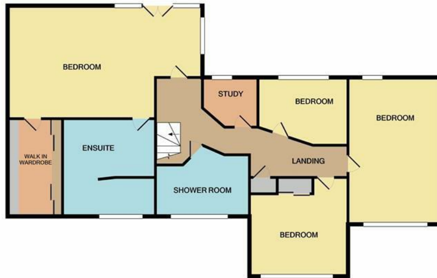
1ST FLOOR APPROX. FLOOR AREA 1092 SQ.FT. (101.5 SQ.M.) TOTAL APPROX. FLOOR AREA 2263 SQ.FT. (210.3 SQ.M.)

While every attempt has been made to ensure the accuracy of the floor plan contained here, measurements of doors, windows, rooms and any other items are approximate and no responsibility is taken for any errors, omissions or mis-statements. This plan is for illustrative purposes only and should be used as such by any prospective purchaser. Made with MapMagic ©2020